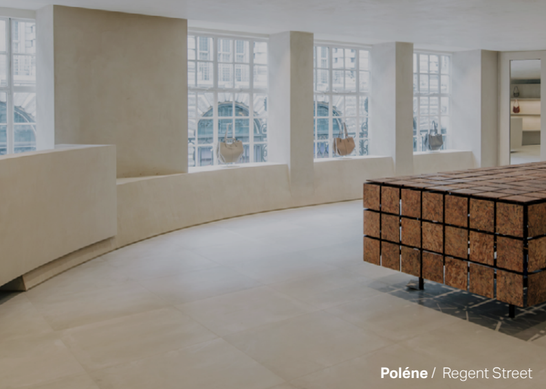
Polène / Regent Street